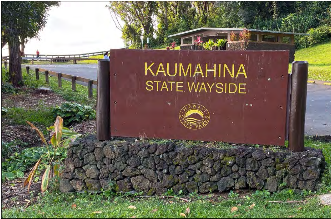
State Parks name sign with fiberglass signposts installed.