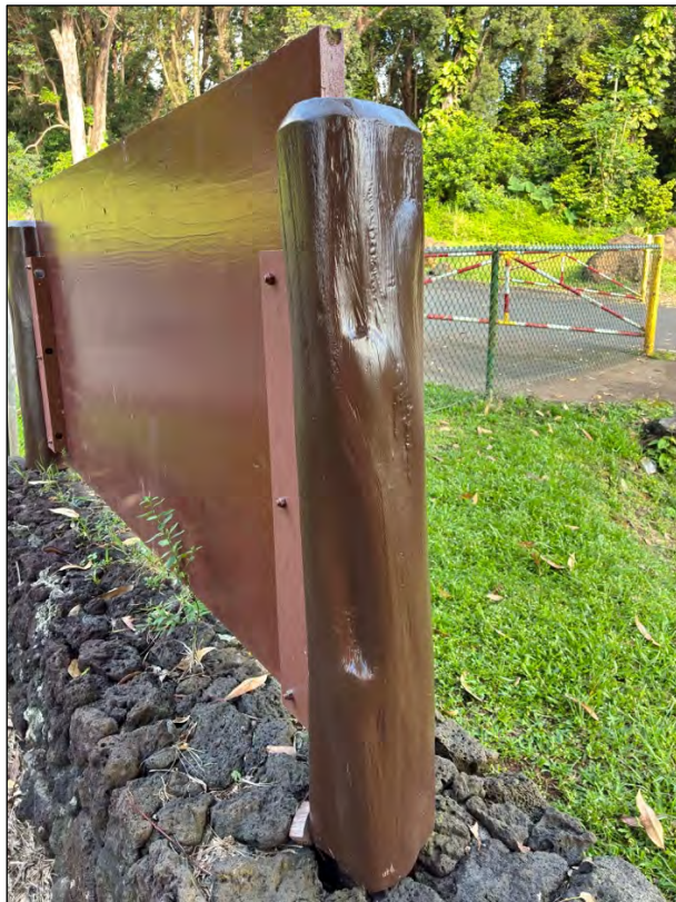
Side view of fiberglass post installed over a metal pipe and resting atop the rock base.