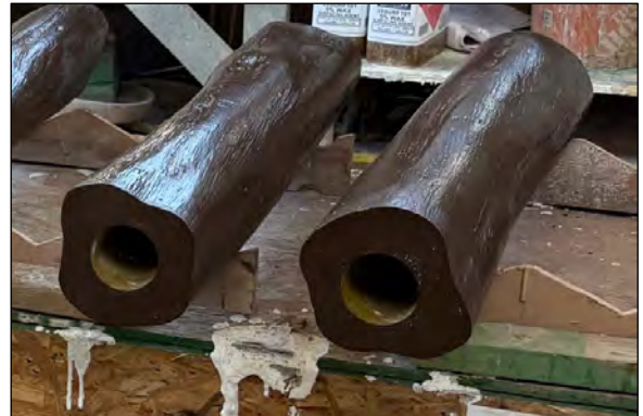
Coring within the fiberglass post for mounting onto a metal pipe.